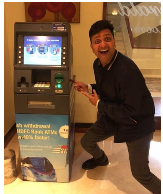
An ATM with no queue... and no cash.

Please pray for India with us this week. The conference is 30th Nov-2nd Dec. It'd be great to have you praying with us. You may have heard about our current cash crisis due to the PM announcing very suddenly that 500 and 1000 rupee notes were becoming illegal tender over night. The banks and ATMs have been over whelmed with massive queues all day every day. There have been not enough new notes in circulation and the new notes coming out are just 2000 rupee notes. So no one has change to buy the basic day to day things. Its very chaotic and stressful for the whole nation.