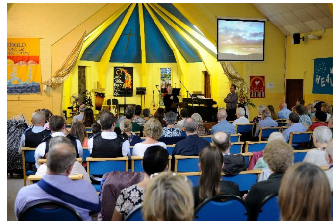
(45ft long x 32ft wide)