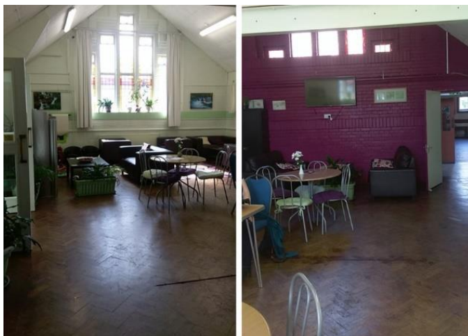
(37ft long x 22ft wide)

This is a warm and inviting area designed to create a relaxing atmosphere, able to seat 80 in varying arrangements.