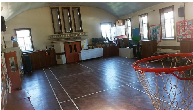
(42ft long x 32ft wide)

The hall allows for soft ball games and raquet sports. Clients can host an array of special functions such as birthday parties ( bouncy castles ), wedding receptions or children's clubs. With use of the stage & PA, seating for approx. 100+ is possible.