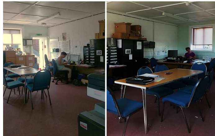
(27ft long x 15ft wide)

Priced in the region of £8,000 per annum. Please contact us direct to arrange a viewing and discuss any particular requirements